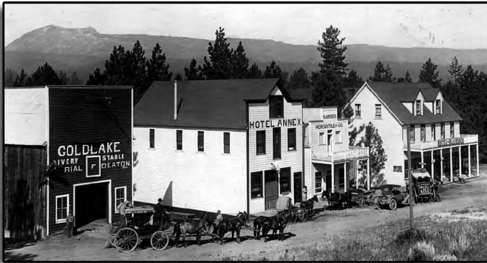
Blairsden, about 1912, viewed to the west. This section of town burned to the ground in July, 1930. It is now occupied by Gumba's, The Village Bakery, and Blairsden Station.

About 1870, the Sierra Iron Company formed, and from that time forward, struggled to make a profitable business out of their plan to build a wood-rail narrow gauge railroad from Mohawk to Beckwourth Pass and also to Quincy. The mines were never activated, and the plan was eventually converted into the Sierra Valleys Railroad that ultimately reached Clio.