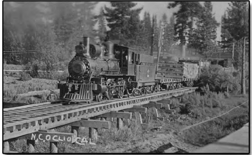
The Nevada-California-Oregon railroad rolls into Clio.