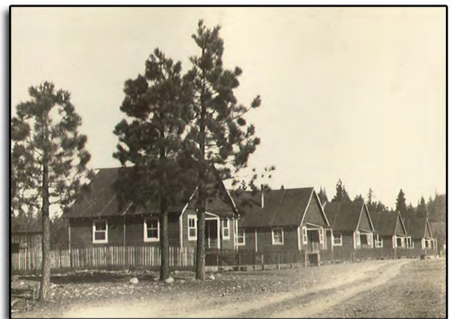
Main Street, Graeagle, now Highway 89, showing the residential cottages of the Graeagle Lumber Company. These are now offices and shops.