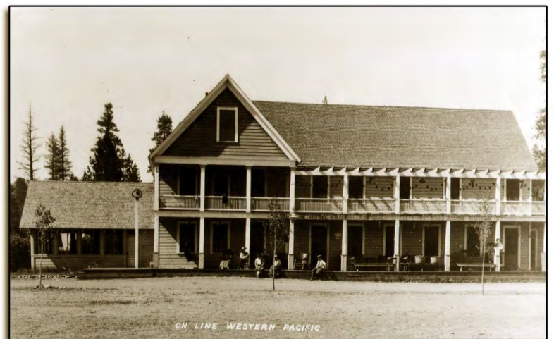
The historic Mohawk Hotel, now in virtual ruins, served residents and visitors to the Mohawk Valley for a century.

Until 1907, through traffic passed across the Middle Fork Feather River at a spot known as "Knott's Ford," approximately where today's number three tee is located on the Plumas Pines golf course. Although it was called a "ford," there was a single lane wood bridge there for many years. In 1907, a new steel bridge was erected across the river about half a mile north of Mohawk, connecting that place with the main road near what was to become the Feather River Inn. This historic bridge washed out in the February 1986 flood. The other main crossing was near the Denten Place, at today's transfer station. The Denten Bridge, as it became known, was a Howe