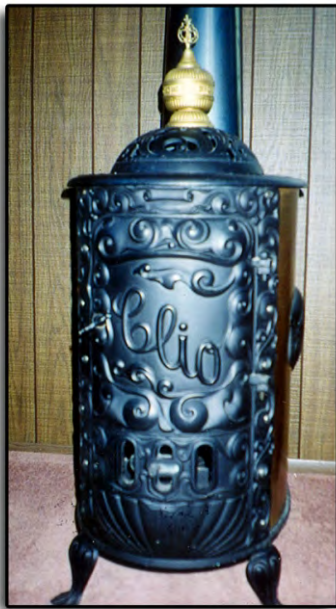
The original Clio stove for which the town was named, now at the White Sulphur Springs Ranch.