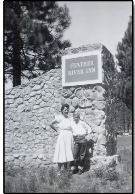
The front gate of The Feather River Inn Ca. 1957.