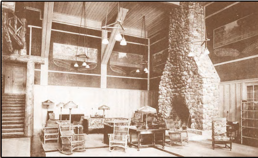
Interior of the Feather River Inn.