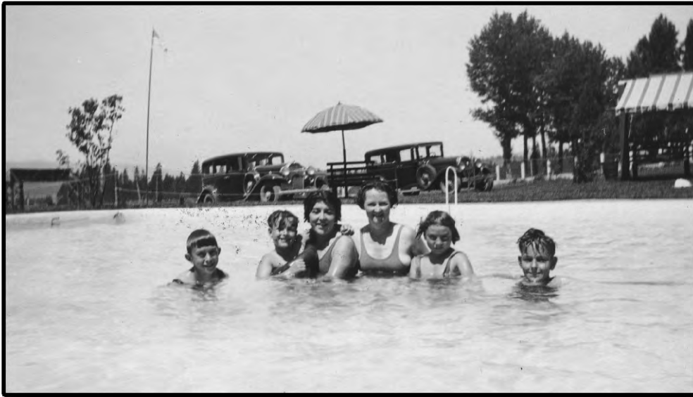
A family outing at White Sulphur Springs.

This article is in no way meant to be all-inclusive, but rather to present a glimpse of this area's long and colorful history: