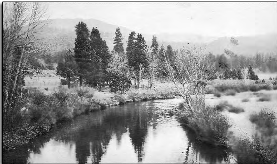
Mohawk Valley, Middle Fork Feather River looking upstream from 1907 bridge.

Although ranching and logging were the primary industries in this part of the valley, there were also a number of small mines operating on the hillsides south and east of the ranch, as well as along the Middle Fork Feather River to the north. In 1859, it was reported that, "At Mohawk Valley the hay is all out, but the cattle can now pick up their own living. Beef is sixteen cents on foot. Flour and vegetables cheap and plenty." The year previous, it was noted that "New diggings have been discovered on Little Frazer river, a stream that waters the Mohawk Valley, in Plumas county, and empties into Middle Feather. We have seen a sample of the gold taken from this stream. It is fine scale gold, and the color indicates good quality. One company (the only one from whom we have received a report) have made an