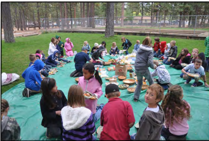
Third graders from Quincy Elementary enjoy a nutritious natural lunch at the First People's Day.

October 5 - 8, 2010 marked the Museum's sixth annual First Peoples' Culture Day activities held at four locations throughout the county. Aimed at teaching Plumas County third graders about the lifeways and culture of the Maidu and other California First Peoples, this year's event, despite some inclement weather, was a resounding success. Schoolchildren from Chester, Greenville, Taylorsville, Portola, and Quincy learned valuable lessons about Maidu beliefs, language, stories and legends, history, and life skills through engaging fun-filled hands-on activities, such as archery, an All Relations NatureWalk, acorn processing, and doll and bullroarer making, while the values of sharing and community were taught with a lunchtime experience in which natural food brought by the students was shared by all.