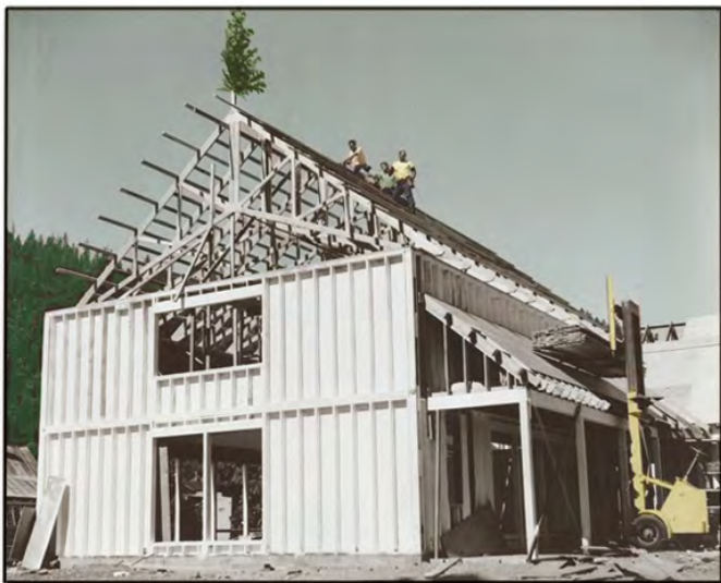
The fir tree was a symbol of good luck.