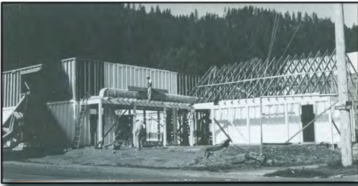
Summer of 1968.

wash the big windows inside and out. My sons Gary, and high-schoolers Bill, and Randy were my crew as we shined the windows, vacuumed, removed paint and Spackle® off of everything. We cleaned up all our construction sites; they were used to it. The Museum was done.