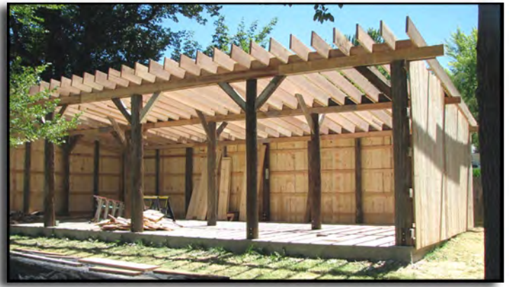
Museum's new pole barn well under way last summer.