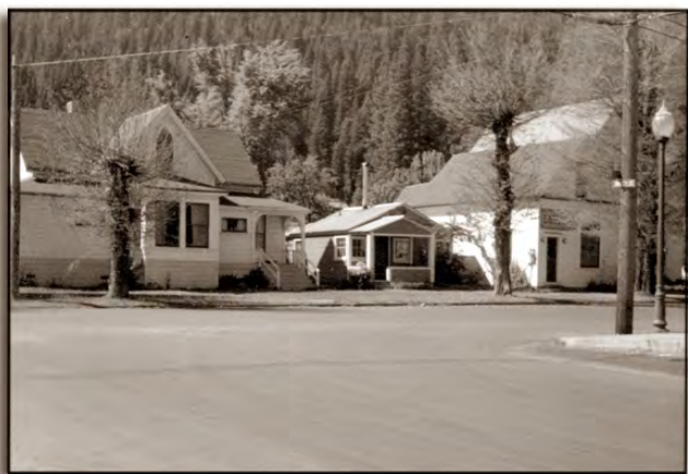
Magnificent historic old Kaulback home that was destroyed to make room for our history museum. To the right of it was a small cottage, and then the 1859 Goodwin Law Office.

Plans called for “piped-in music,” a new thing then, but the sound engineer would handle that. The buzz words were “hi-fi stereo,” and “woofers and tweeters.” It was so state-of-the-art, so modern! And plans included air conditioning, not necessarily a commonplace thing.