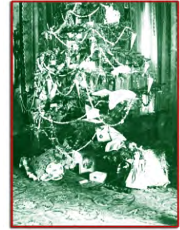
Christmas tree at Illinois Ranch, Thompson Valley.

Boy Scout Troop 151 provided the tree for this year's Holiday Season.