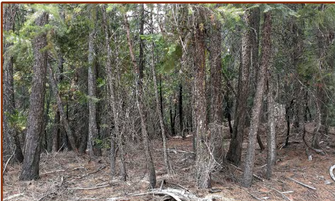
“Dog Hair Thicket” is a term used to describe overgrown conifer stands such as this one. With the exclusion of fire these types of stands can be found throughout the Sierra Nevada Mountains.

Upon the arrival of western settlers Native American burning slowed dramatically. Shepherders and cattlemen, however, also understood the benefit of burning and used fire to manage meadows and control understory vegetation. Timbermen also understood the benefits of burning to control unwanted logging slash and vegetation in the woods. This practice continued through the early 20th Century, but in 1910 a significant fire suppression policy shift began taking shape. The deadly Big Burn of 1910 kicked off an aggressive fire-fighting campaign and with it came a change in Sierra Nevada forests as they became overgrown with vegetation. 17 As can be seen throughout Plumas County, “dog hair thickets” of White fir and Incense Cedar exist in many areas, and dead woody material continues to accumulate on the forest floor.