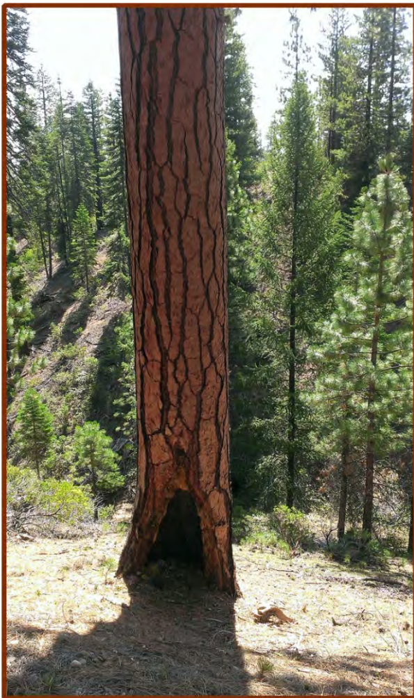
Old growth Ponderosa pine with fire scar from a low intensity backing fire. The thick plated bark provided the protection necessary for it to continue to be a healthy tree.