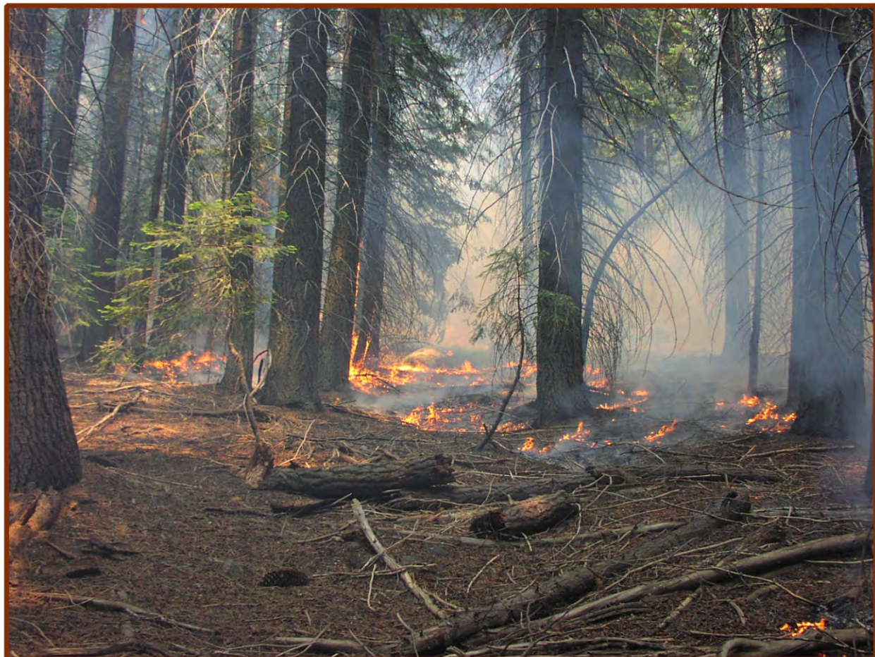
Low intensity ground fire in a stand of mature conifers.