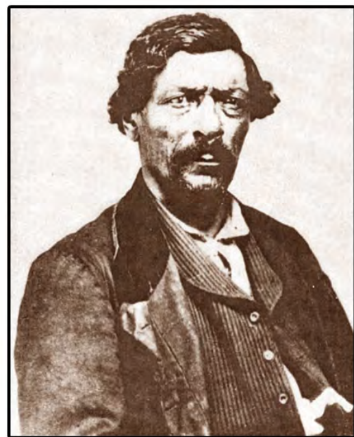
James P. Beckwourth in the 1860's