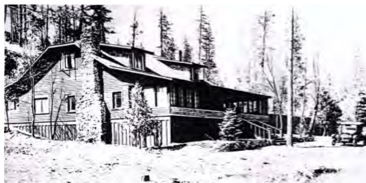
Left, dust jacket for Tiger Eye , 1930. Center, Bower's Pocket Ranch near Oakland Camp, 1915. Top, dust jacket for Open Land , 1933.