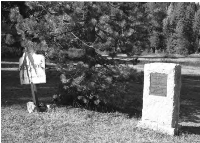
Philip Linthicum Grave Marker

Twenty Mile House. Located at 300 Old Cromberg Road, Cromberg, about 10 miles east of Blairsden. Clampers placed a bronze plaque here in 1969 to honor this historic stage stop, hotel, and store built about 1887 on the original Quincy-Reno Road. In 1945, the Magill family refaced the original wood siding with used brick.