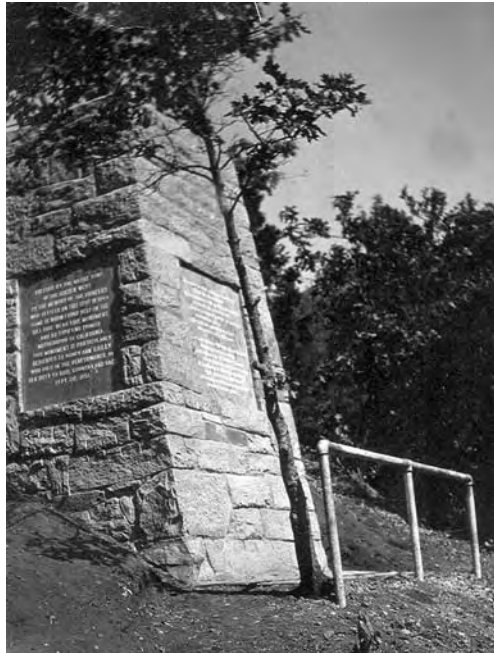
Rich Bar Cemetery Marker

Peter Lassen Marker, California State Landmark No.184. About four and half miles east of Greenville on the north side of North Valley Road. The granite slab and bronze marker placed by the Native Sons and the Native Daughters