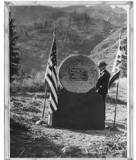
1850 Emigrant Trail Marker

Pioneer Ski Area of America, California State Landmark No.723. Plumas Eureka State Park, Johnsville. The bronze plaque, erected by the State of California, Plumas County Historical Society and Plumas Ski Club in 1961, is located on a boulder in front of the Plumas Eureka State Park Museum to honor Plumas County's early-day downhill ski or “longboard” history.