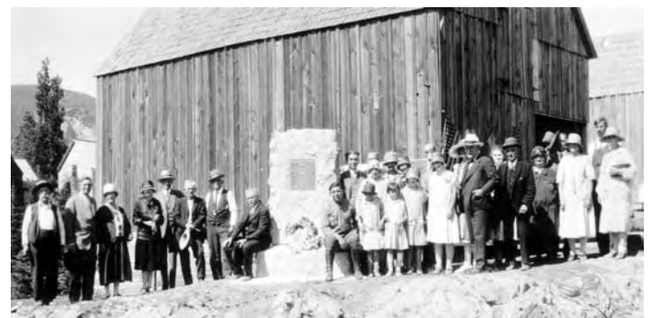
Rabbit Creek Marker

Rich Bar, California State Landmark No.337. Twenty miles west of Quincy at a large turnout on State Highway 70. A large stone monument and bronze plaque along the highway overlooks one of California's most famous gold