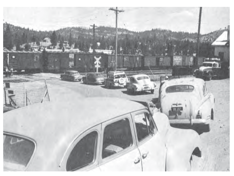
Beckwith Street grade crossing before construction of the Gulling Street Overpass in 1954.

The road to Reno until the 1930s was graveled and took two and one-half hours to travel, even if you didn't get a flat tire. During the big snowstorm of 1911, snow-bound residents received their mail the old fashioned way; by skis.