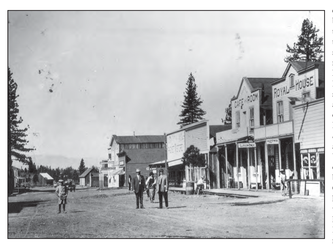
The north side of Commercial Street, Portola, about 1912, view to west.

Portola has sported five different names, the first four within three years: 1905, Mormon; 1907, Headquarters; 1908, Imola and Reposa, and from 1909 on, Portola. Reposa was rejected by the U.S. Post Office because it was too similar to Repressa, located at Folsom State Prison. With the 140th anniversary of the discovery of San Francisco Bay by Gaspar de Portola, Virgilia Bogue, daughter of Western Pacific survey engineer, Virgil Bogue, suggested "Portola." This name was enthusiastically accepted.