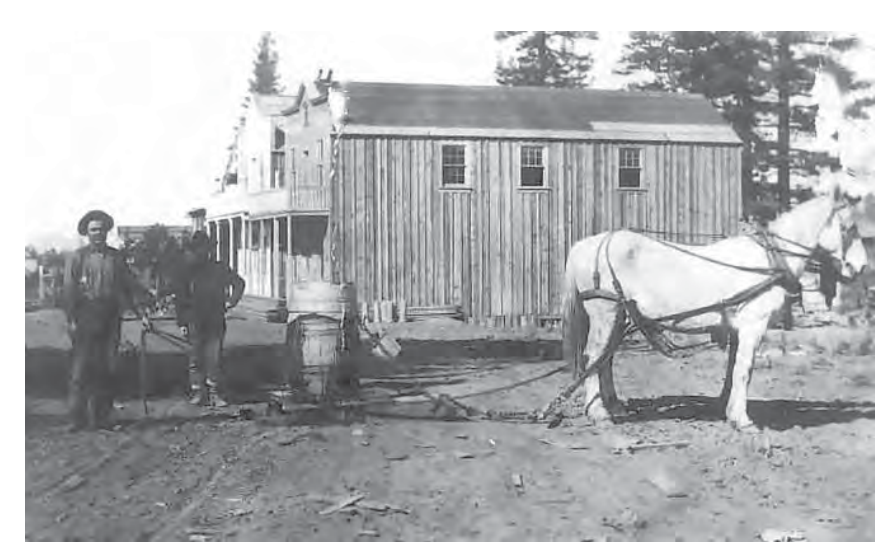
Portola Water Works, about 1909.

The first newspaper in Portola began publication on May 12, 1910 as the Portola Gazette. This was a tiny four-column, four-page sheet with completely hand set type. In 1912 it suspended operations due to lack of advertisers. After the Gazette folded, the Portola Headlight came on the scene. Only