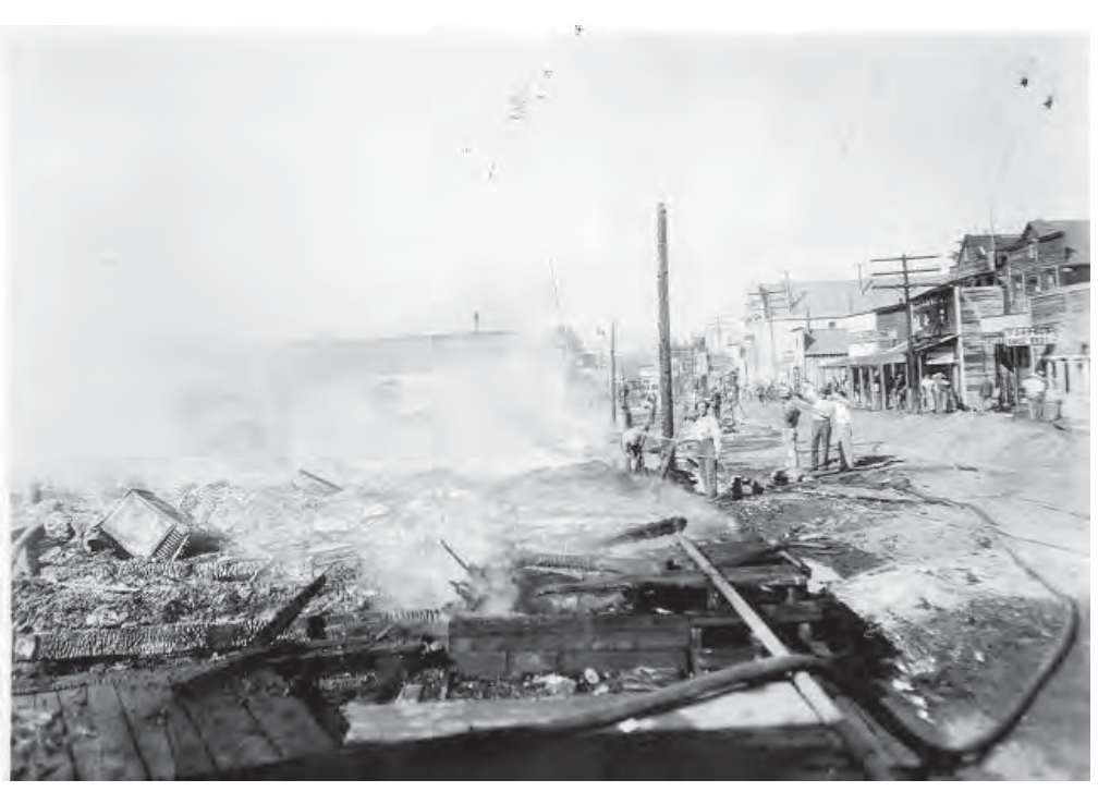
Remains of the south side of Commercial Street on August 24, 1928.

In the early 1930s, there were thirteen saloons on Commercial Street with all kinds of gambling: dice, Chinese Lottery, blackjack, poker, and slot machines. Three restaurants were open twenty-four hours a day and dances