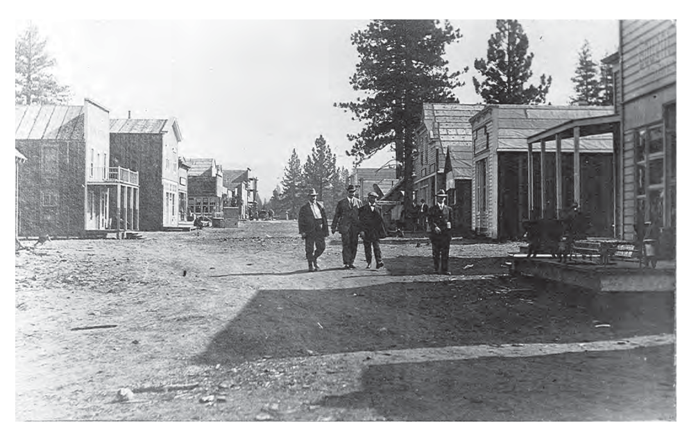
Commercial Street, Portola, viewed to the east in 1910.

Roberts Lumber Company plunked down on the north side of the river in 1910 and attempted to lay out a different town in competition with Reno Mill & Lumber Company. They hoped to draw construction to Main Street near the Durham Hotel.