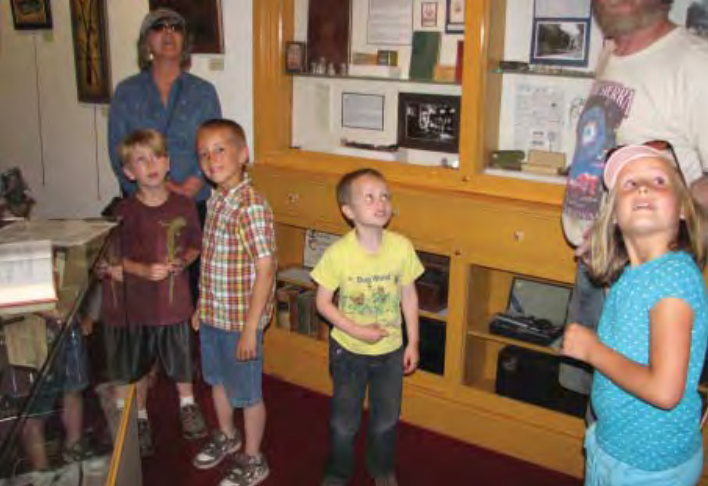
A group of Pioneer Elementary students from Sweet Home Daycare visited the museum this May.