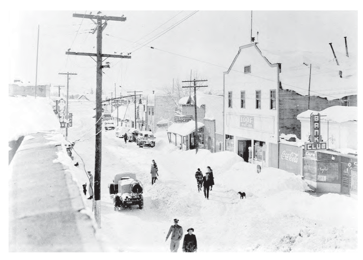
Commercial Street during the winter of 1952, view to west.