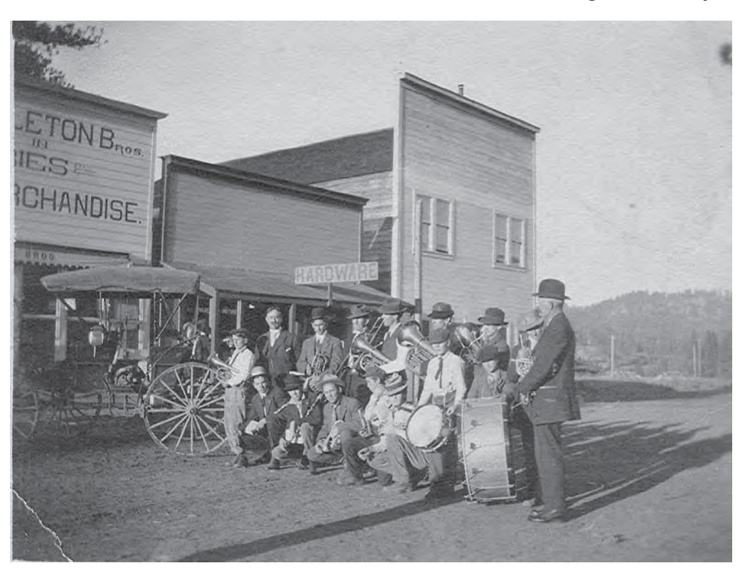
The Portola Brass Band is shown ready to play at a baseball game about 1912.

in wishing Portola a happy and prosperous Centennial!