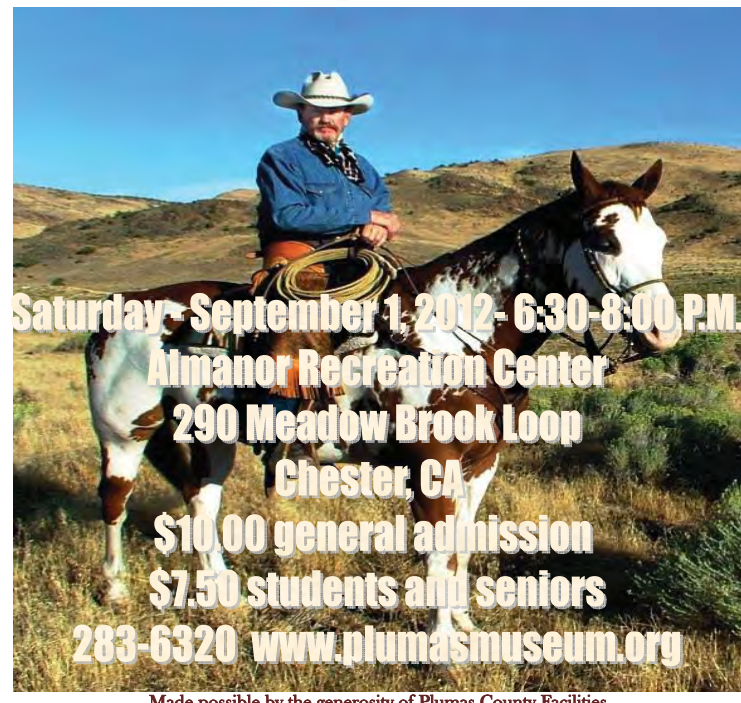
Made possible by the generosity of Plumas County Facilities

and a grant from Poets & Writers of California