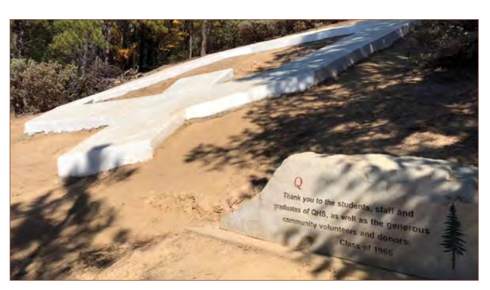
The Q June 8, 2019.

The Q has stood the test of time and 85 years later still shines as a symbol of Quincy High School and the community of Quincy itself.