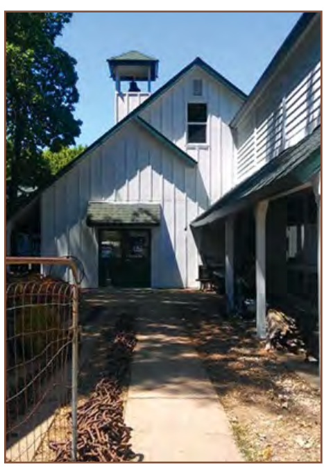
Exhibit Yard Entrance.

Like thousands of businesses across California, the Museum closed to the public on March 19, 2020 due to the COVID-19 pandemic.