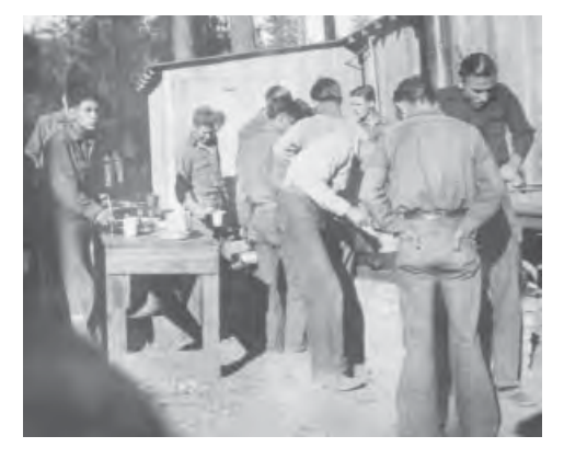
"Chow time," Rich Gulch Camp, 1934.