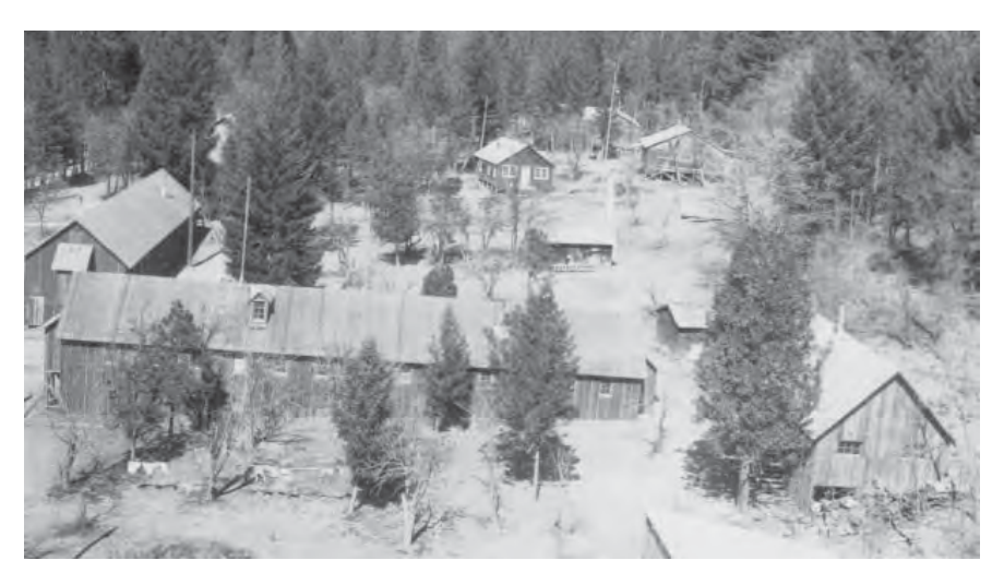
CCC Camp 989 at Rich Gulch on the Feather River, 1934.

Roosevelt's oft-quoted speech from his first inaugural address in March 1933 illustrated the depth of the