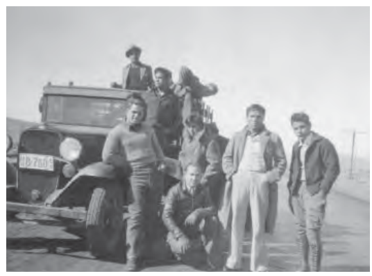
"Work Gang on way to Portola, 1933."