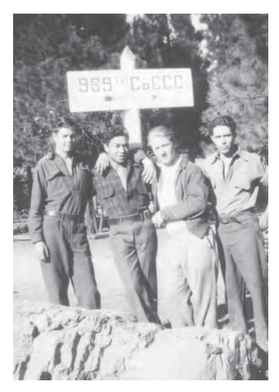
The 989th Company was moved from Quincy to Rich Gulch in October 1933.

and themselves," by sending them into the woods and mountains to plant trees, build parks and roads – employment that saved many of them from starvation and crime. On the Plumas County level they built roads, trails, fire lookouts, campgrounds, and a host of other similar projects.