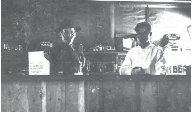
"Rich Gulch PX Canteen, 1934."