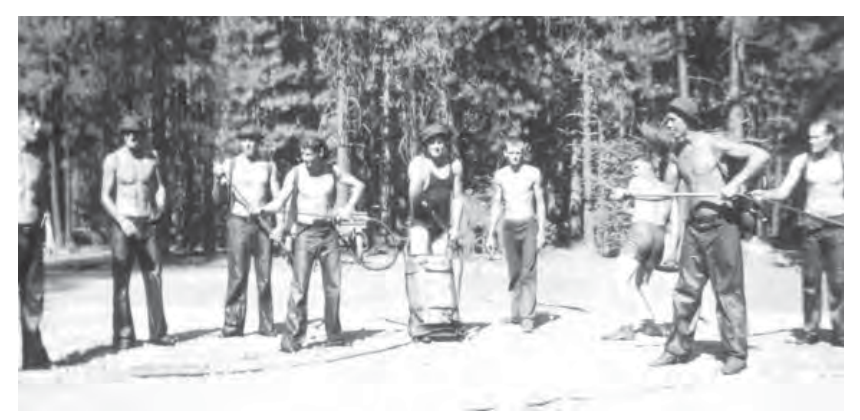
Fire training at Camp 989 Feather River Experimental Station, Quincy, 1933.

By the spring of 1933 it was reported that 2200 men would be coming to some eleven camps on the Plumas National Forest. These would house about 200 men each. It was stated the Quincy Camp at today's Mt. Hough Ranger District was to be the first of 166 camps established in California, but it appears the Challenge Camp was the first built on the Plumas National Forest in May of 1933.