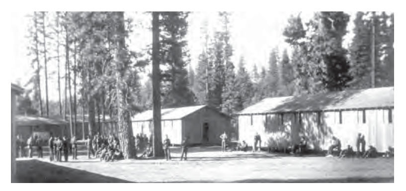
Barracks at Camp 989 Feather River Experimental Station, Quincy, 1933.

Plumas County sent off some of her own, with a quota of 25 to meet. Some of the young men were