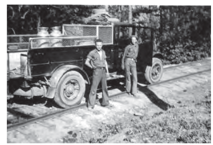
"Bringing [lunch] to the gang."