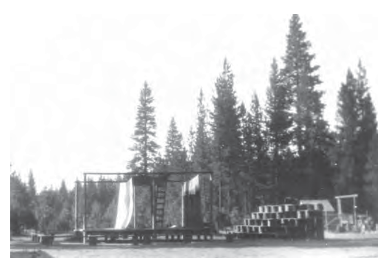
Boxing ring set up at Camp 989 Feather River Experimental Station, Quincy, 1933.

The Roosevelt administration was the best friend unions ever had in the White House. FDR told labor leaders that they had to create