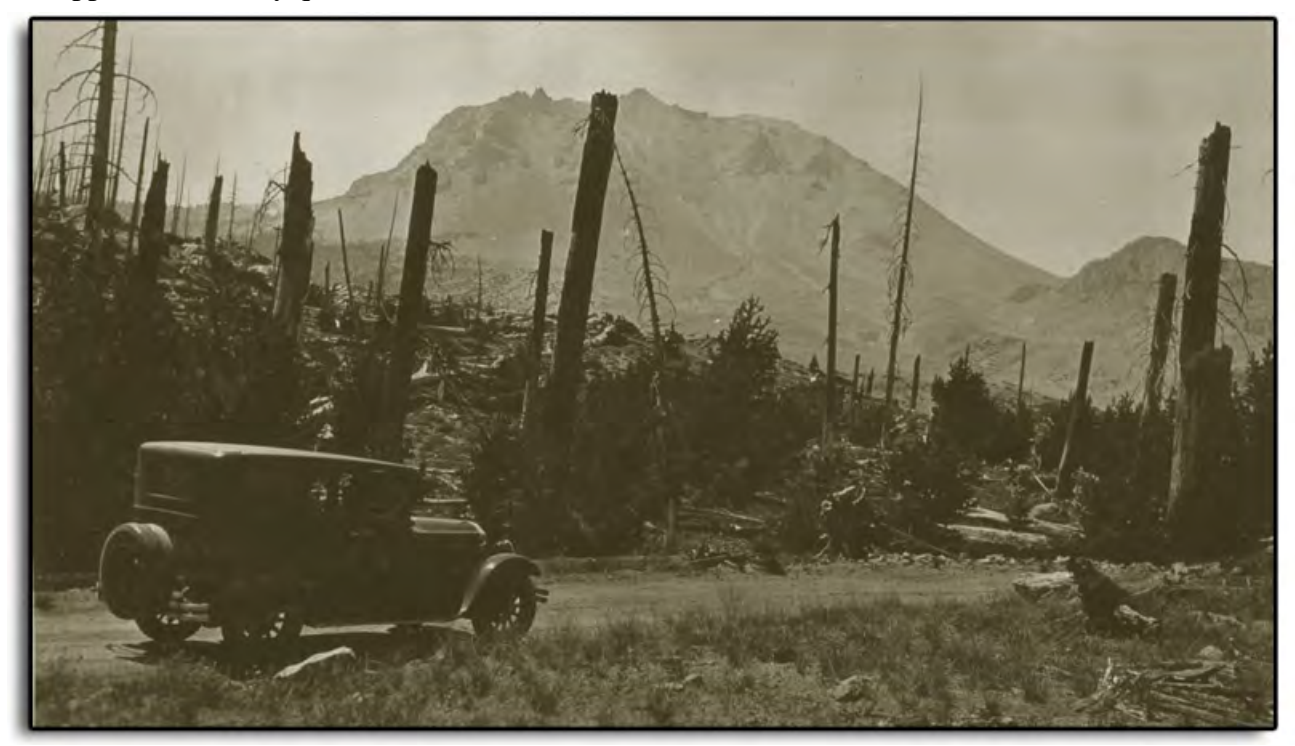
A photo of the Devastated Area on Lassen Peak's northeastern flank.

helpless feeling that some of the local residents must have had. They were at the mercy of an active volcano that did not appear to have any quit in it.