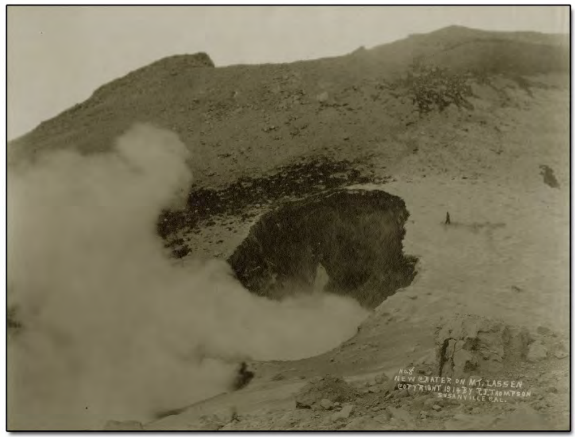
Lassen Peak's active crater was closely observed by photographers, newspaper reporters, scientists, and other daring members of the public. The photo shows one of those adventurous individuals getting ever so close to the crater's rim.

The first eruption occurred on May 30, 1914 in the form of steam explosions. This occurs when rising magma heats groundwater to the point that it becomes pressurized and vents through fissures near the surface. After the initial eruption, steam explosions on Lassen Peak would become a common occurrence and rarely did a week go by without the Plumas National-Bulletin reporting on its status. On June 11, 1914 a report from Big Meadows (Lake Almanor) states that, "steam is flowing steadily from the mountain" and "spouting intermittently." Though the initial eruptions may have appeared somewhat harmless, the "tremendous explosions" that occurred on June 12-14 made it clear that Lassen Peak was becoming increasingly violent.