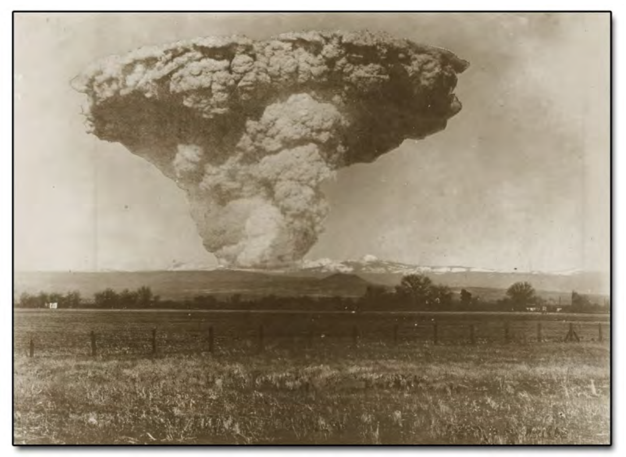
May 22, 1915 eruption viewed from Anderson, California.

into Lost Creek and Hat Creek. The lower Hat Creek Valley became flooded and the few people that were there escaped to safety before their homes were destroyed.