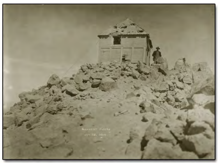
October 12, 1914 photograph of Lookout House on top of Lassen Peak. The structure had obviously taken a beating and would be completely destroyed by October 20th.

By 1915 Lassen Peak "had produced at least 110 observed" eruptions, and cloud cover may have obscured many more. Lassen Peak was undoubtedly behaving increasingly violent and unpredictable and those who lived at the base of the mountain in Mineral, Viola, and Hat Creek Valley were becoming very apprehensive. Chester would be covered with volcanic ash and "while the peak cannot be seen from Quincy, the column of smoke and ash arising from the volcano was prominent on the northwestern horizon." As the volcano continued to erupt one can only imagine the