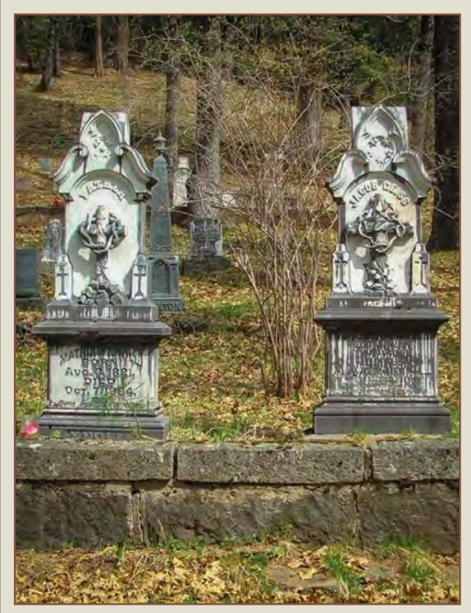
Knoll family plot.

We want to remind you that the Indian Valley Museum is open from 1 - 4PM on the Saturday of our event, so please support them by arriving early and allowing time to peruse the Museum. After acquainting yourself with a little Indian Valley history at the Museum, you can head right next door to our Grave Occasion event at the Taylorsville Cemetery.