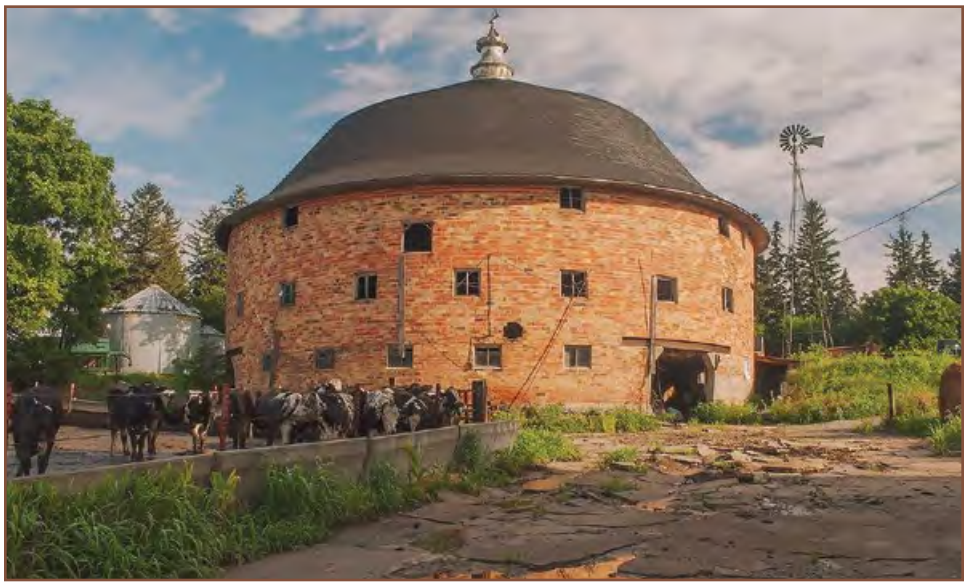
Round Barn Near Conroy, Iowa