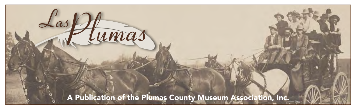
Volume 44 • Number 2