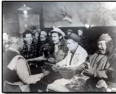
Noah Beery Jr, Gilbert Roland and Alan Ladd in the Capitol Club.

A studio still from the movie Guns of the Timberland , a western released in 1960 with film locations in Feather River canyon, Blairsden and Guidici Ranch in Sierra Valley as well as the Capitol Club.