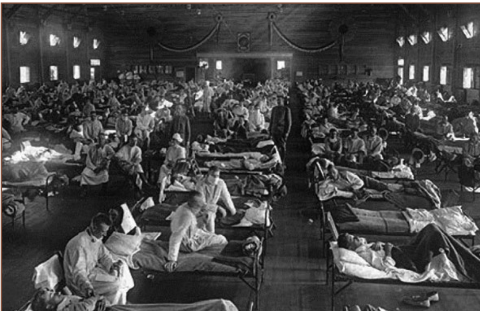
Emergency Hospital, Camp Funston, Kansas, 1918.