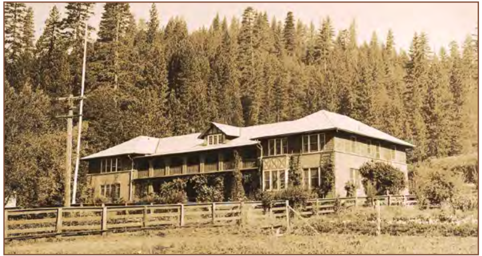
Plumas County Hospital and Farm, Quincy, c.1918.

As precautionary measures produced their desired outcomes, and the waves of flu that had hit Plumas County began to subside and become more sporadic in nature, the Spanish Flu seemed to