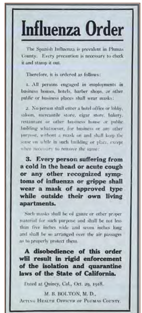
Influenza Order Plumas National Bulletin, October 31, 1918.

A week later, on November 14 th , news of Germany’s defeat made the headlines, and Plumas County citizens temporarily disregarded