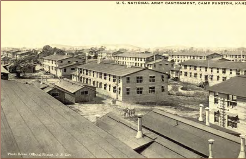
U.S. National Army Cantonment, Camp Funston, Kansas.

With World War I raging in Europe (the end of hostilities was still nearly a month away), rhetoric about the disease took on a decidedly militaristic tone even from the beginning, with one cartoon equating the flu's deadliness to that of poison gas shells. Just a week after its first mention in Plumas County, one headline screamed, "Spanish Flu Invades Plumas County Towns," and called the disease the "foreign invader."