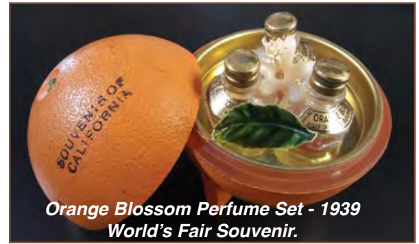
Orange Blossom Perfume Set - 1939 World's Fair Souvenir.