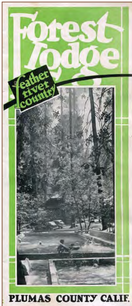
Forest Lodge Brochure.

(Ng Gah Pay) jugs, 1900-1915, two glass beer bottles, 1905-1915, one Chinese food pot, two Chinese rice or soup bowls, 1860-1900; four canning jars, 1903-1930, one foodstuff bottle, 1905-1910, two snuff crocks, 1900-1910, one stoneware ale bottle, 1870-1900, one glass mucilage jar, 1899, one "Gaston Dairy" milk bottle, 1925-1939, one "Hostetters Stomach Bitters" bottle, 1880-1900, one rum bottle, 1898-1910, two food jars, 1911-1920, one salt shaker, 1911-1920, two ceramic mustard pots, 1895 – 1915, one wine bottle, 1870-1890, one Chinese liquor bottle, 1870-1890, 6 champagne bottles, 1870-