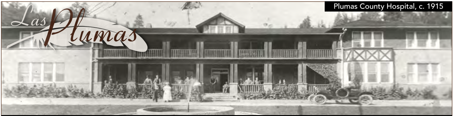
Plumas County Hospital, c. 1915

A Publication of the Plumas County Museum Association, Inc.