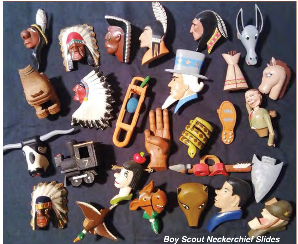
Boy Scout Neckerchief Slides