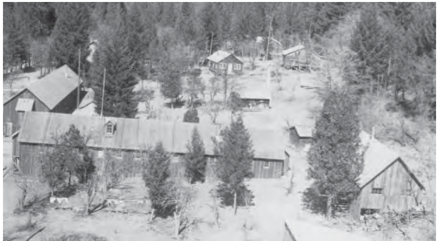
CCC Camp 989 at Rich Gulch on the Feather River, 1934.

For example, the Civilian Conservation Corps (CCC) hired 3.5 million young men “to redeem the land