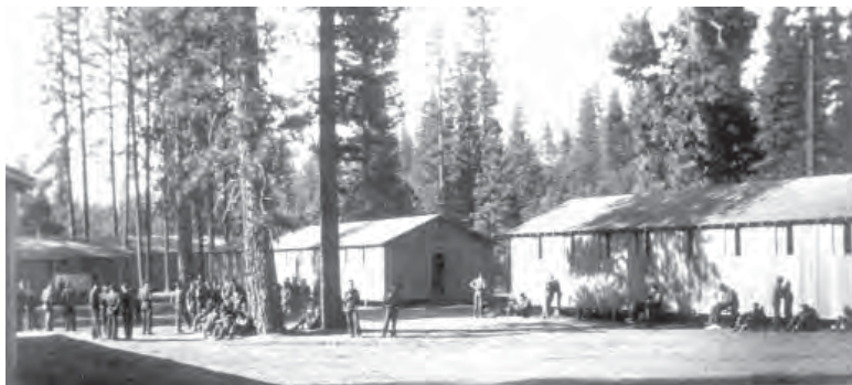
Barracks at Camp 989 Feather River Experimental Station, Quincy, 1933.

Plumas County sent off some of her own, with a quota of 25 to meet. Some of the young men were