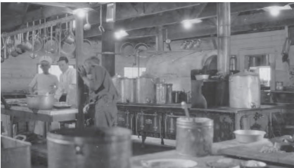
Kitchen for the mess hall at Rich Gulch CCC Camp 989, 1934.

Perhaps some of you reading this article and seeing the accompanying photos will know someone who worked in the CCC or has some memories of various New Deal projects that have become a part of Plumas County's history. Please contact the museum if you have any information or photos you would like to share.