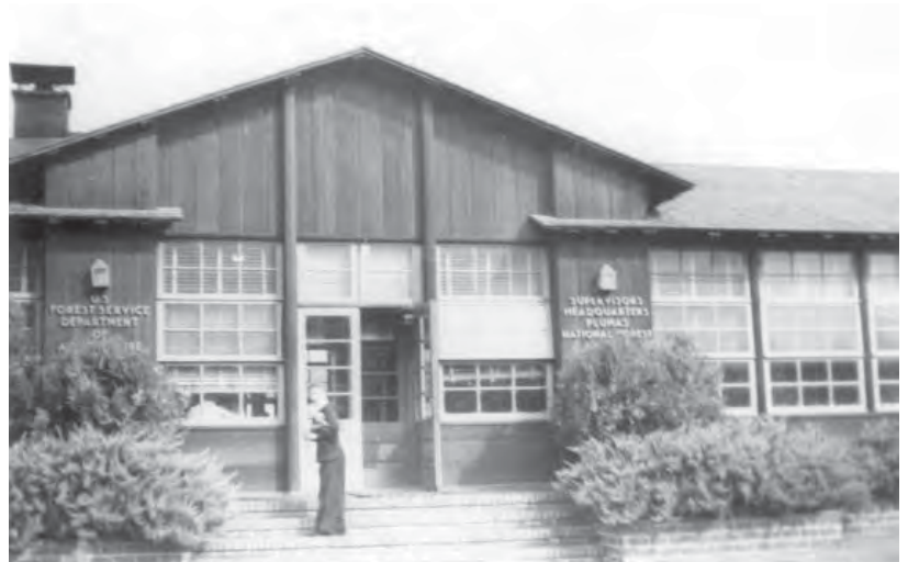
Plumas National Forest Supervisor’s Office, October 1947. The front entrance has been relocated to the west. This was built by the CCC in 1933-1934.