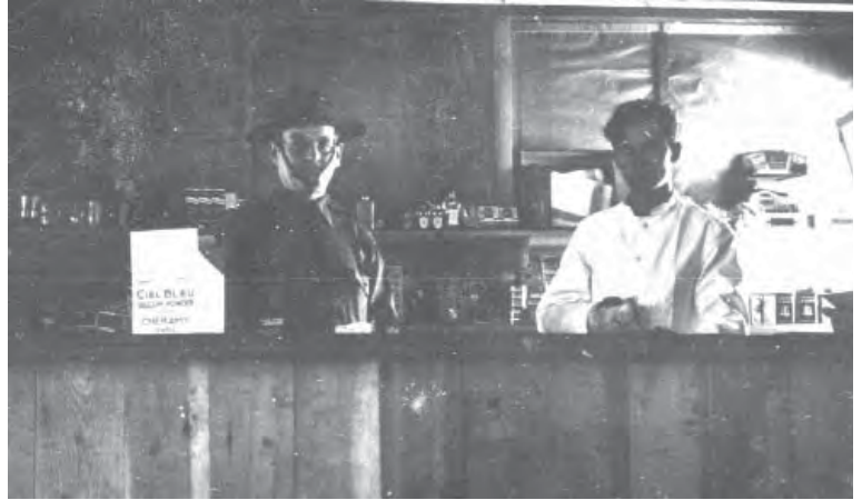
“Rich Gulch PX Canteen, 1934.”