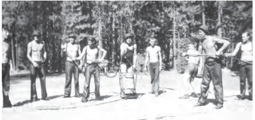
Fire training at Camp 989 Feather River Experimental Station, Quincy, 1933.

By the spring of 1933 it was reported that 2200 men would be coming to some eleven camps on the Plumas National Forest. These would house about 200 men each. It was stated the Quincy Camp at today’s Mt. Hough Ranger District was to be the first of 166 camps established in California, but it appears the Challenge Camp was the first built on the Plumas National Forest in May of 1933.