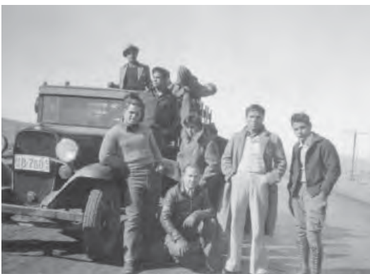
“Work Gang on way to Portola, 1933.”