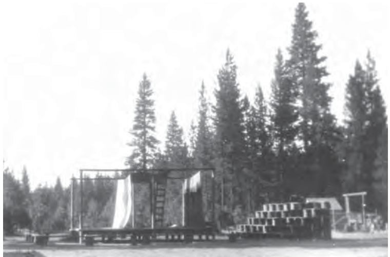
Boxing ring set up at Camp 989 Feather River Experimental Station, Quincy, 1933.

In Plumas County, a perusal of the Feather River Bulletin for the years 1933 and 1934 discloses a number of news articles related to the federal government’s efforts to stem the Depression, and in particular,