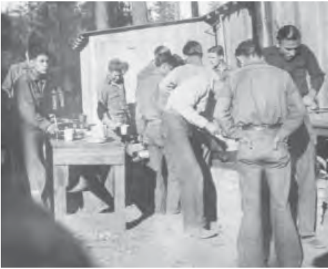
“Chow time,” Rich Gulch Camp, 1934.