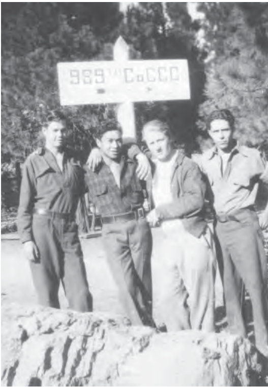
The 989th Company was moved from Quincy to Rich Gulch in October 1933.

and themselves,” by sending them into the woods and mountains to plant trees, build parks and roads – employment that saved many of them from starvation and crime. On the Plumas County level they built roads, trails, fire lookouts, campgrounds, and a host of other similar projects.