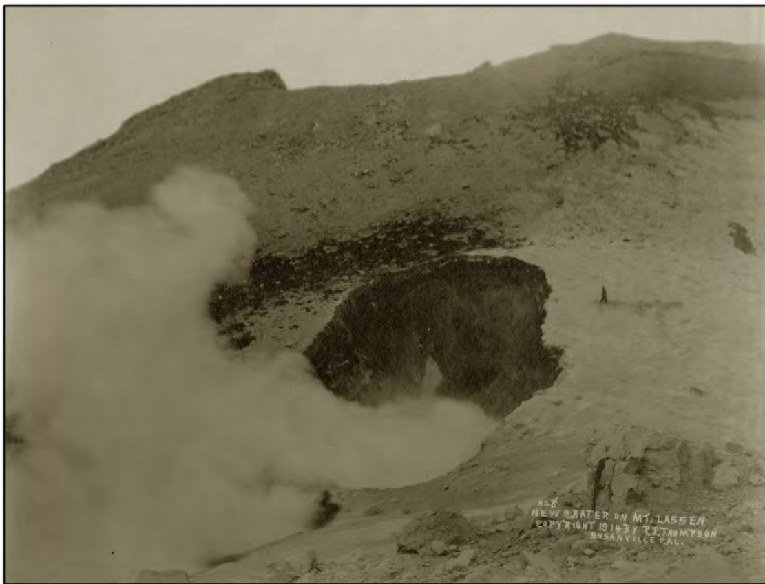
Lassen Peak's active crater was closely observed by photographers, newspaper reporters, scientists, and other daring members of the public. The photo shows one of those adventurous individuals getting ever so close to the crater's rim.

The first eruption occurred on May 30, 1914 in the form of steam explosions. This occurs when rising magma heats groundwater to the point that it becomes pressurized and vents through fissures near the surface. After the initial eruption, steam explosions on Lassen Peak would become a common occurrence and rarely did a week go by without the Plumas National-Bulletin reporting on its status. On June 11, 1914 a report from Big Meadows (Lake Almanor) states that, "steam is flowing steadily from the mountain" and "spouting intermittently." Though the initial eruptions may have appeared somewhat harmless, the "tremendous explosions" that occurred on June 12-14 made it clear that Lassen Peak was becoming increasingly violent.