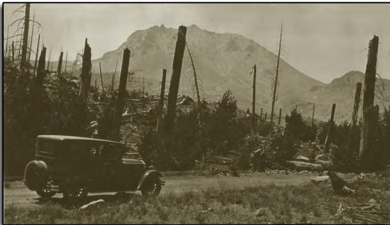
A photo of the Devastated Area on Lassen Peak's northeastern flank.

helpless feeling that some of the local residents must have had. They were at the mercy of an active volcano that did not appear to have any quit in it.