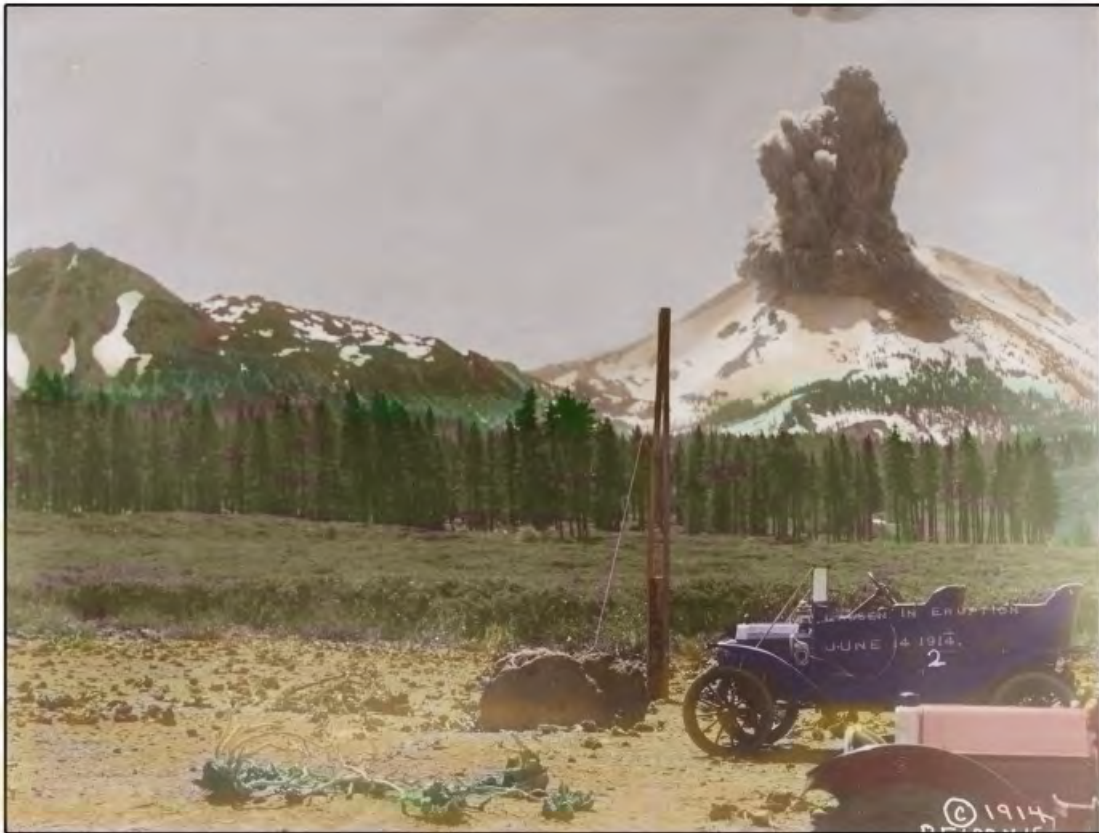
Benjamin Franklin Loomis is known for the extraordinary photographs that he took of Lassen Peak while in a state of eruption. The initial eruption, June 14, 1914

By Al Klem, Plumas County Museum Association Trustee