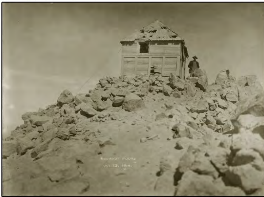
October 12, 1914 photograph of Lookout House on top of Lassen Peak. The structure had obviously taken a beating and would be completely destroyed by October 20th.

By 1915 Lassen Peak "had produced at least 110 observed" eruptions, and cloud cover may have obscured many more. Lassen Peak was undoubtedly behaving increasingly violent and unpredictable and those who lived at the base of the mountain in Mineral, Viola, and Hat Creek Valley were becoming very apprehensive. Chester would be covered with volcanic ash and "while the peak cannot be seen from Quincy, the column of smoke and ash arising from the volcano was prominent on the northwestern horizon." As the volcano continued to erupt one can only imagine the