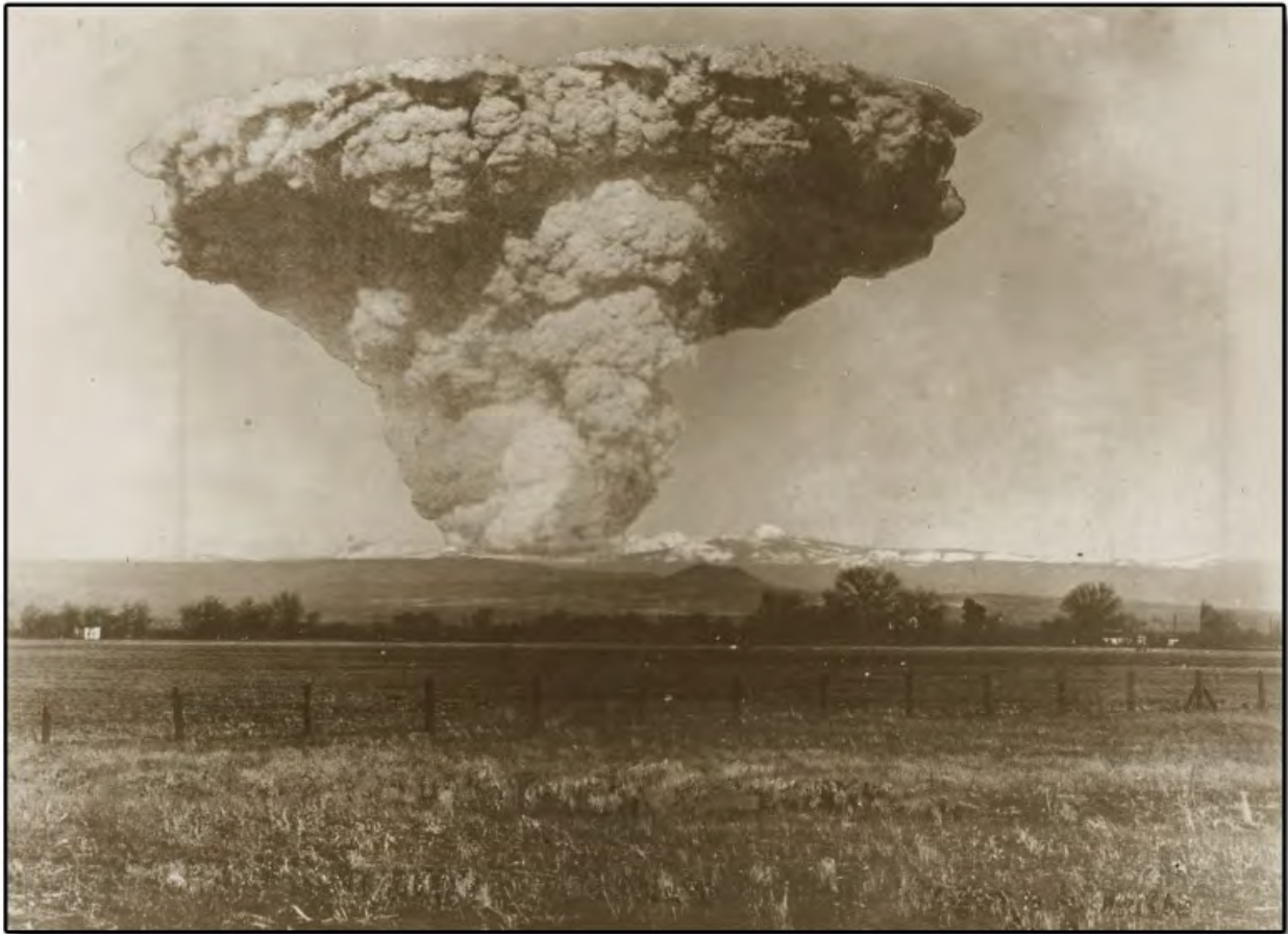
May 22, 1915 eruption viewed from Anderson, California.

into Lost Creek and Hat Creek. The lower Hat Creek Valley became flooded and the few people that were there escaped to safety before their homes were destroyed.